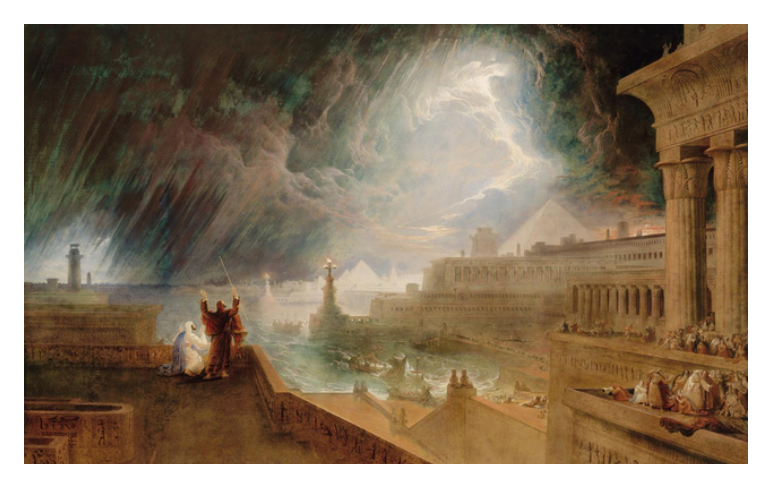
John Martin, The Seventh Plaque of Egypt, 1823